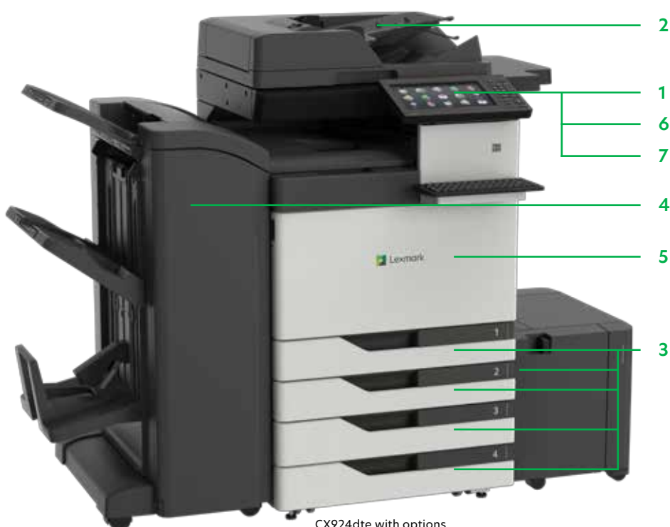
CX924dte with options

Print Microsoft Office files, PDFs and other document and image types from flash drives, or select and print documents from network servers or online drives.