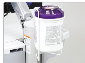
SV Sani-wipes Holder