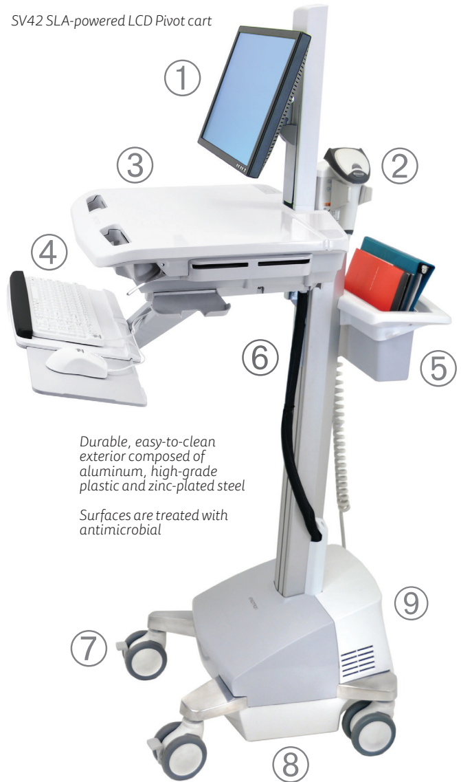
SV42 SLA-powered LCD Pivot cart

Durable, easy-to-clean exterior composed of aluminum, high-grade plastic and zinc-plated steel