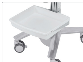
SV Front Tray