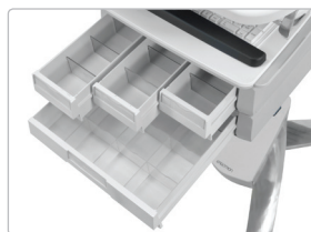
Several drawer configurations